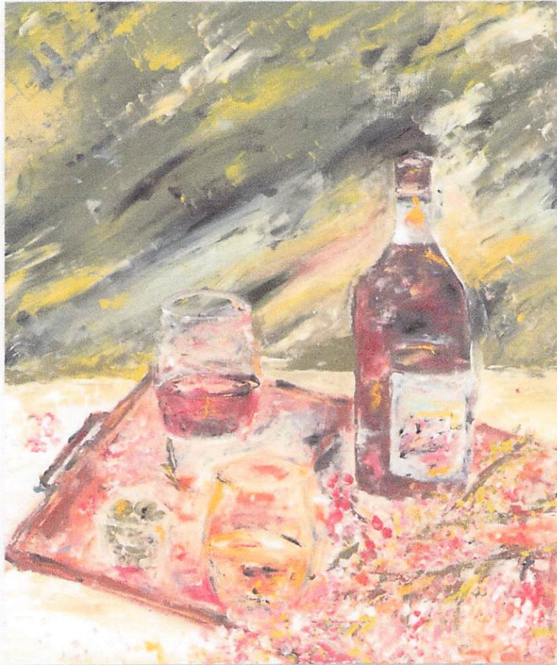
My Time and Space Acrylic on Canvas, 61 x 73 cm by Adeline Yeo USD27,600 + tax